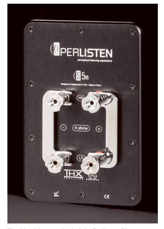
The bi-wiring terminal of the Perlisten Signature S5M is of course of high quality and is ready for uncompromising bi-amping.

A most warm welcome to the "crème de la crème" of standmount loudspeakers – as the sole STEREO top reference! ■