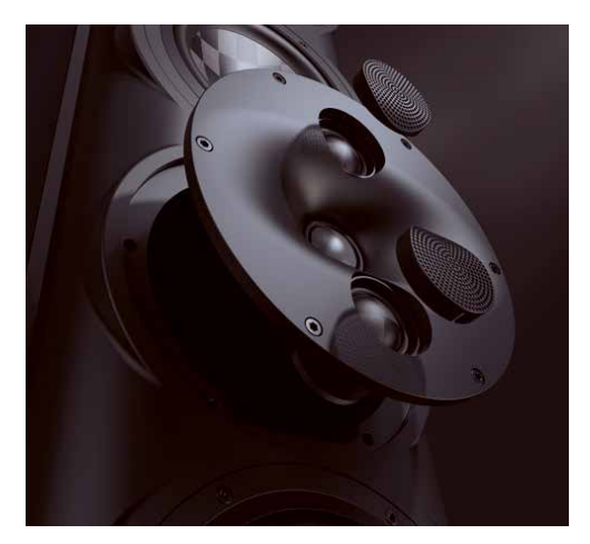
This is what the DPC array looks like, with the outer midrange drivers only coming out of their "holes" for illustrative purposes here.

And yet we have to proclaim that the offered level of bouncy and rhythmic precision and fulminant force is unparalleled. Especially for standmount speakers. After all, the S5M does bring a lot of volume, which is easily sufficient for frequencies around 40 Hertz. In short: Wow!