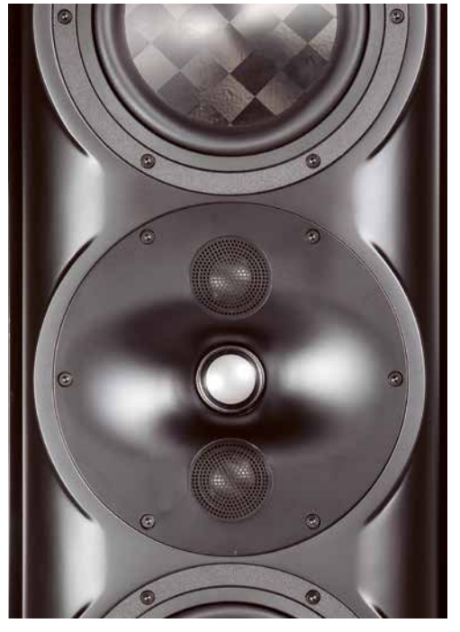
The proprietary design with three domes and waveguide is functionally reminiscent of D'Apollito and is intended to minimize room influences.

The amount of direct sound is correspondingly high here. Meticulous phase stability as well as the geometric layout are important in this design, because correct time alignment and linearity are of great importance and determine the desired degree of precision and plasticity. You might indeed be reminded of the well-known, traffic lightlike "D'Appolito configuration" with just one dome tweeter and two cones. You wouldn't be entirely wrong with that; but all three drivers, their lower moving masses and the corresponding rise times are much closer together here. Not to forget that Perlisten Audio also holds some patents for its proprietary array. Of course, the competitor M&K also offers three tweeters, every cinema fan knows that – but still, everything is rather different here.